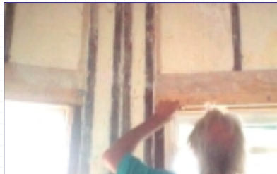
Icynene® is sprayed directly into the wall cavity. The foam softly expands to fill all of the cracks and crevices around the studs and window casings. Any excess foam is easily trimmed in preparation for drywall.