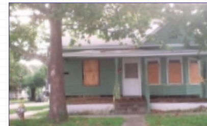
Icynene®, a high-performance insulation, was selected to address the homeowner's strong allergic sensitivity and reaction to mold and mildew.