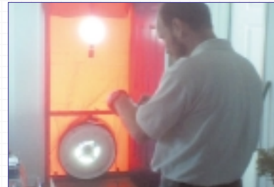
After the Icynene® application, blower door test data confirmed that this home met and exceeded the energy efficient requirements for designation as an EPA Energy Star™ Home.