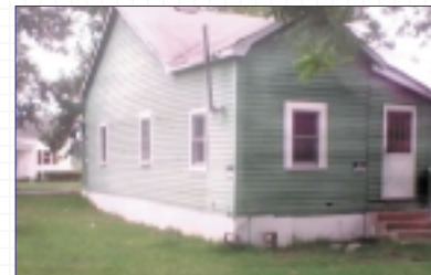
This abandoned home in Wilmington's historic district was gutted and restored to meet Energy Star™ standards.

The challenge was to convert this previously abandoned house into an Energy Star™-rated home. To earn the Energy Star™ designation, the home must receive a minimum Home Energy Rating (HERS) of 86, which translates to at least a 30% increase in energy efficiency versus the Model Energy Code.