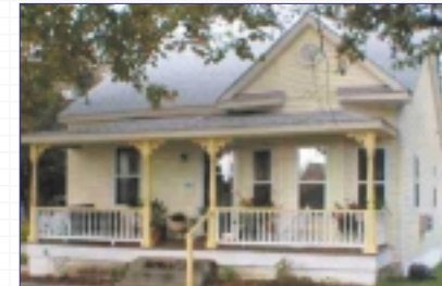
Icynene® was key in restoring this heritage home, which was once considered irreparable. Now, the home provides the owner with a Healthier, Quieter, More Energy Efficient® environment.

Icynene's philosophy of building tight and ventilating right proved to be a successful technique, according to the data supplied by the homeowner: