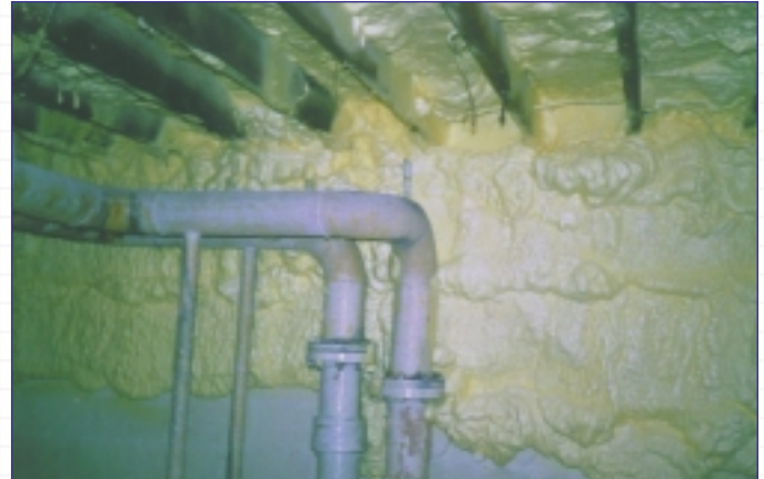
The gaps/cracks were sealed with Icynene® to prevent air leakage and from the above grade exterior.