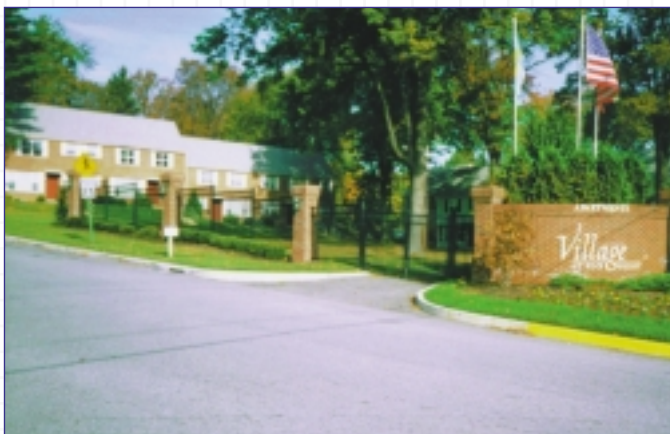
The Village at Fox Point, Wilmington Delaware.

Over time, The Village at Fox Point fell into disrepair and became a problem within the Wilmington Delaware community. In 1995, the property was purchased by owners who planned to renovate the complex and create mid-priced rental units.