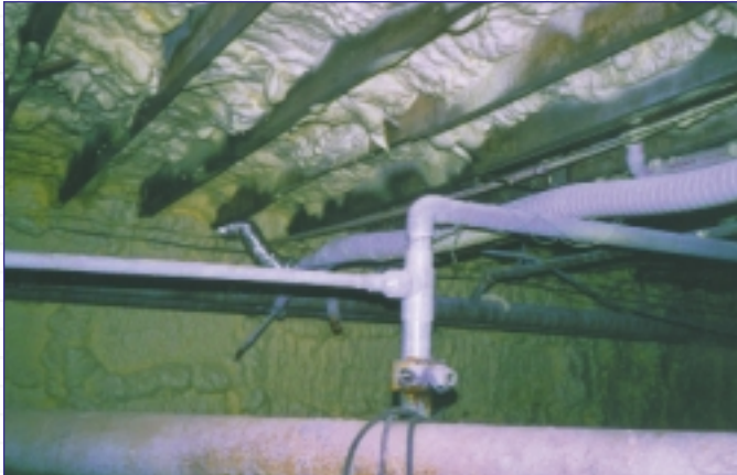
After 3.0 inches of Icynene® was applied underneath the floors and on the walls of the crawlspaces