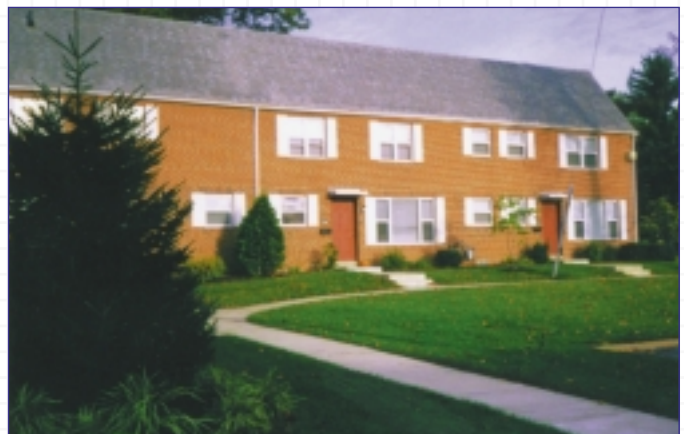
A close-up of one of the 56 buildings located on the property.