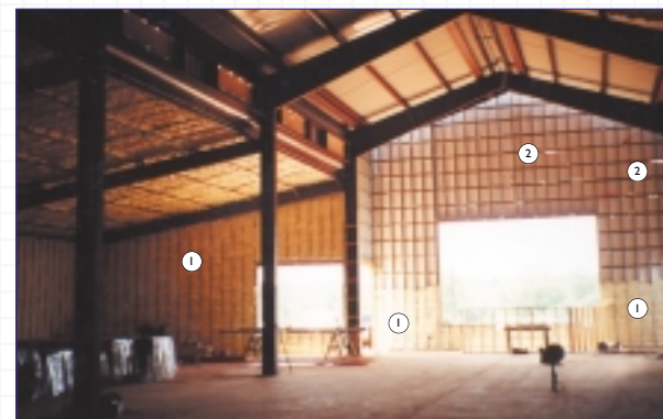
Icynene® installed into the exterior wall cavities, prior to the installation of drywall. (1) Icynene® sprayed area, (2) unsprayed area, note the gaps where air can freely pass through the wall. Daylight highlights these gaps.