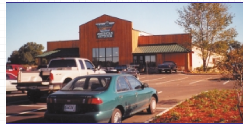
American Outdoor Adventures has 15,200 sq. ft. of retail and office space in Albany, Georgia.